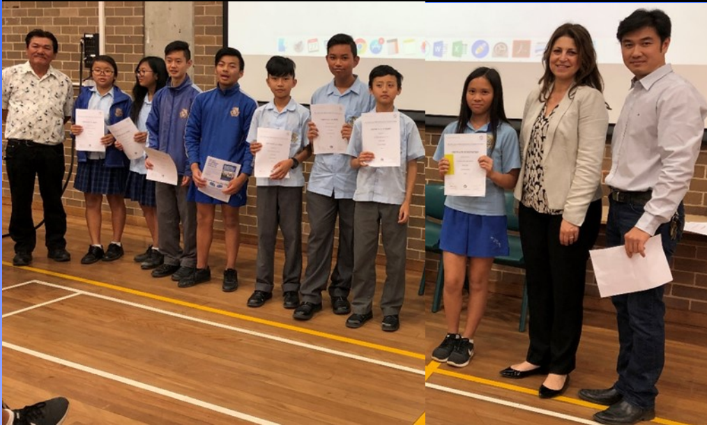
Congratulations Year 7 and 8 students