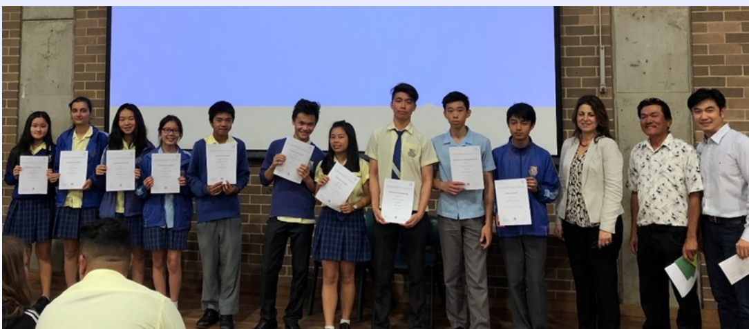
Congratulations Year 10 and 11 students