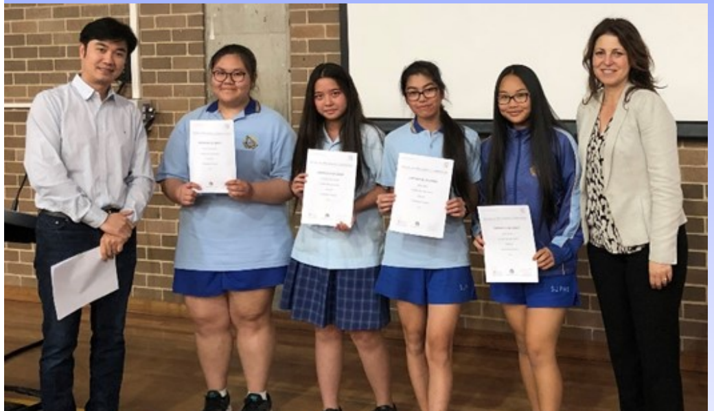
Congratulations Year 9 students